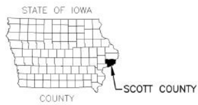
Figure 1. Project Area Vicinity